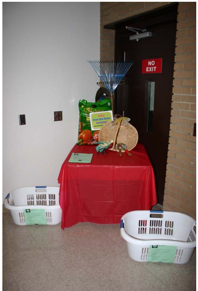
HOPE PROJECT DISPLAY AND COLLECTION CENTER