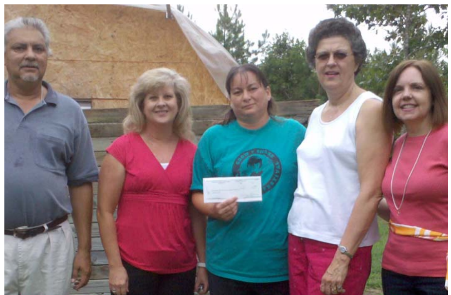
THE WOMEN'S MISSION GROUP VISITED GROW AND SHARE IN ZEBULON ON JULY 27TH AND DELIVERED A WONDERFULLY LARGE PILE OF SUPPLIES AND A CHECK FOR THE FUNDS THEY RAISED