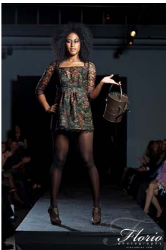
GARMENT #1 AND GARDEN PAIL