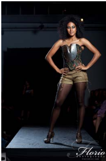
GARMENT #2 WITH WEARABLE SHOVEL