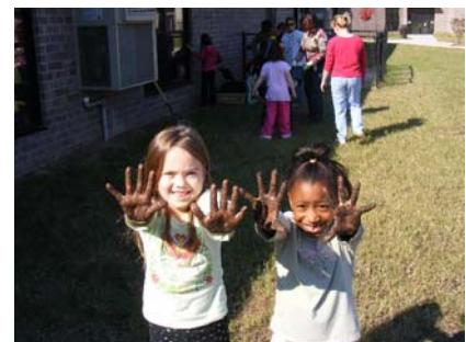
LONG MILL ELEMENTARY SCHOOL GARDEN INSTALLATION DAY