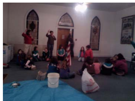
FRANKLINTON GIRL SCOUTS

■ Grow And Share 70 Harrison Street Zebulon NC 27597