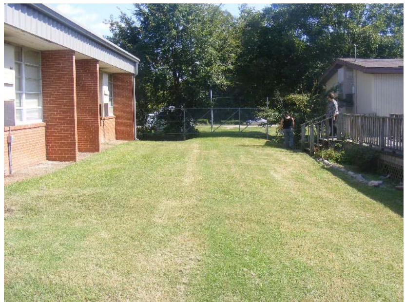
FRANKLINTON ELEMENTARY SCHOOL GARDEN-TO-BE

learning about plants in our science study and will integrate the study throughout math and reading in my AIG classes for grades 1-5. My students will engage in planting seeds, pulling weeds, and harvesting the produce. We will distribute the vegetables at our local senior center where we can also provide community outreach. We just can't wait to experience our own gardening."