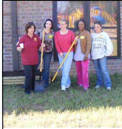
LONG MILL ORGANIZERS

With the help of a multi-grades teacher, Franklinton Elementary will install a school garden March 2010. The garden will be used to teach the "AIG" students on a variety of topics