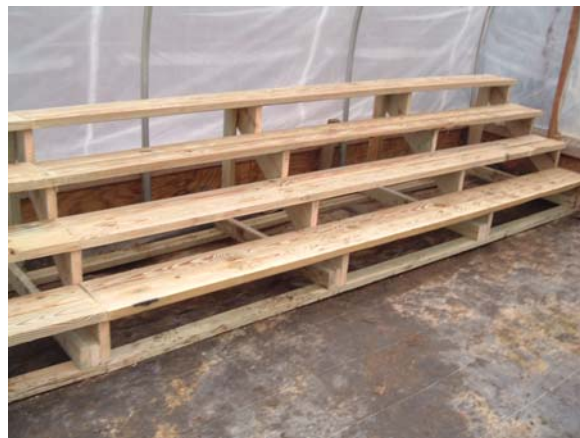
PHOTOS OF THE NEW GREENHOUSE BLEACHER SHELVING